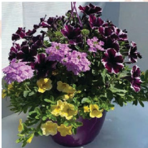
12" Premium Patio Planter. Assortment of plants & flowers $30.00