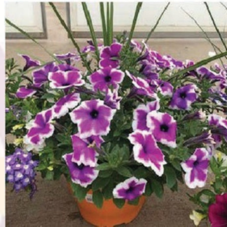
10" Premium Patio Planter Various Colours $25.00