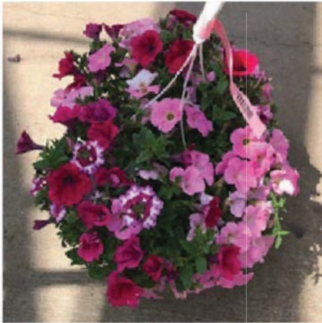
10" Premium Hangin Various Colours $25.00

PICK-UP AT CHURCH ON SAT. MAY 11; 10a.m- 2p.m.