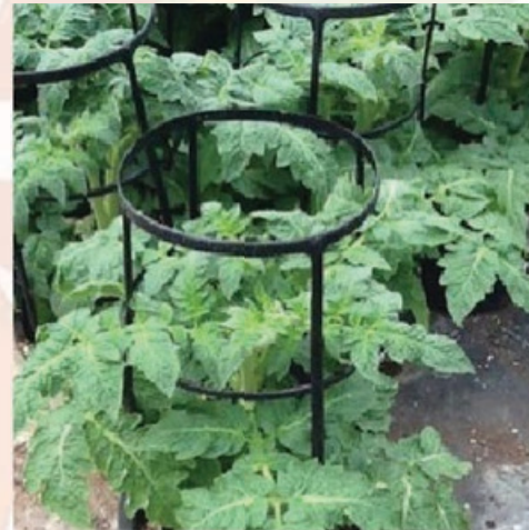
10" Tomato Planter with cage Various Types $20.00

All Plants Grown Locally With Care By BLUE GRASS SOD FARMS LTD.